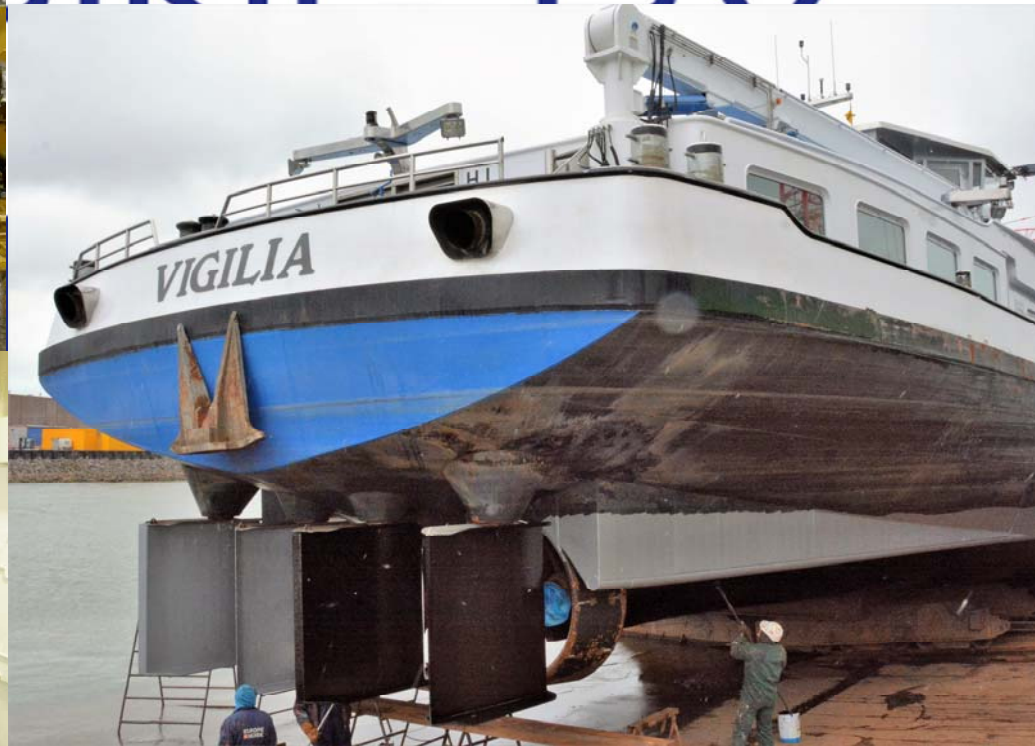
High manouverbility Strong rudders & Propelles