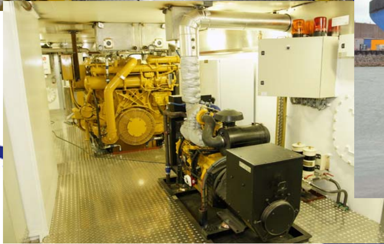
Diesel engines Euro5 standard