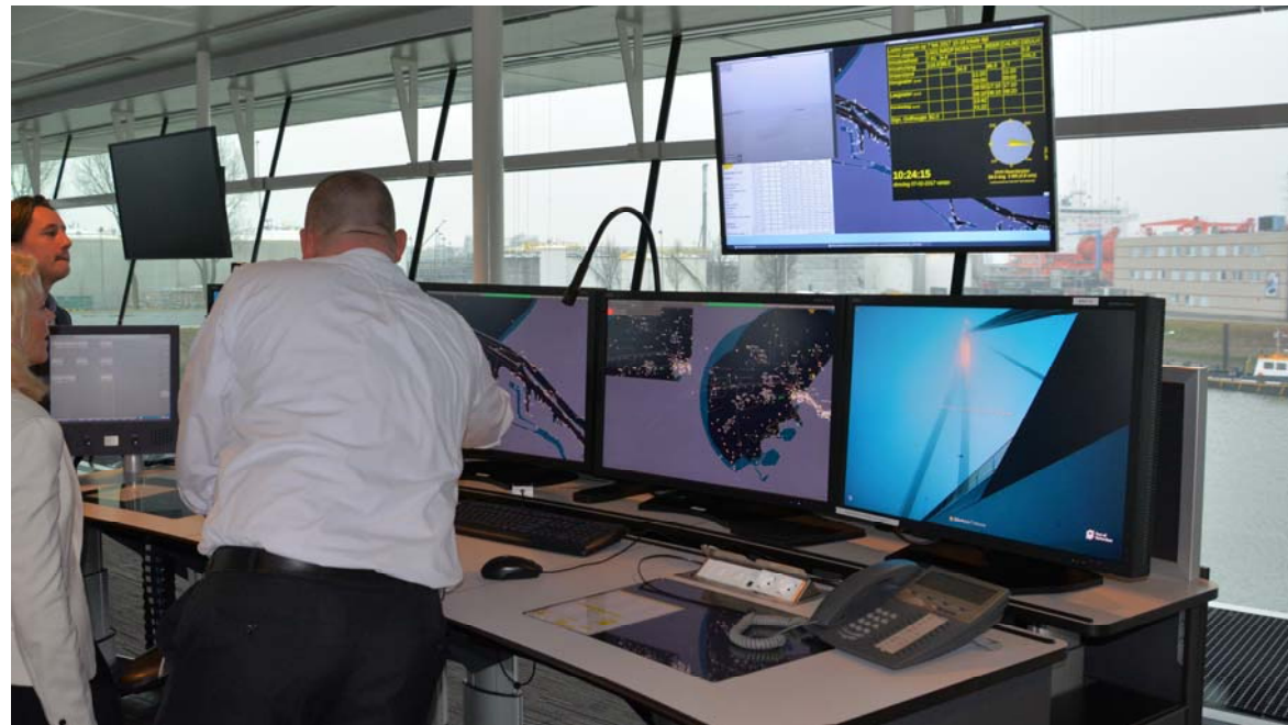
Port of Rotterdam – Traffic Control